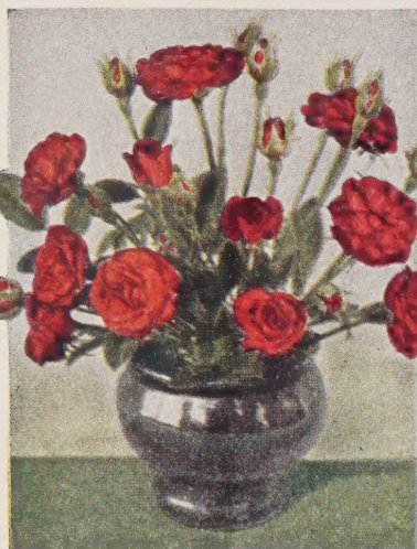
MIDGET (Plant Pat. No. 466)